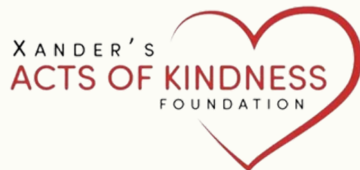
Xander's Acts of Kindness